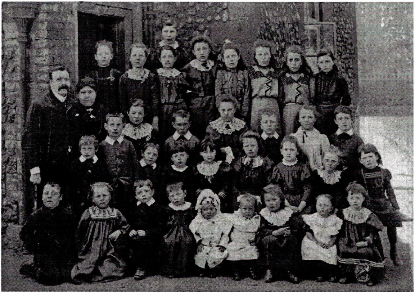
Great Dunham School photo at the turn of the century (approx. 1899-1902).